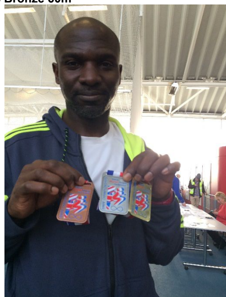
On my way to a Gold medal and World Record Score for Great Britain in the M40 Indoor Pentathlon