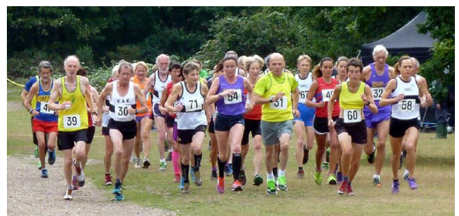
WOMEN & MEN 65+